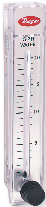
Model RMB-SSV 5" scale, 8-3/4" high