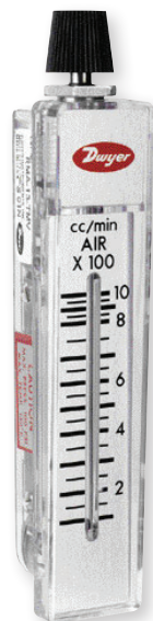
Model RMA-TMV 2" scale, 4-13/16" high