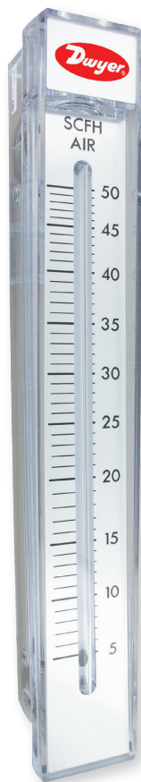
Model RMC 10" scale, 15-3/8" high

2", 5" or 10" Scale, Interchangeable Bodies